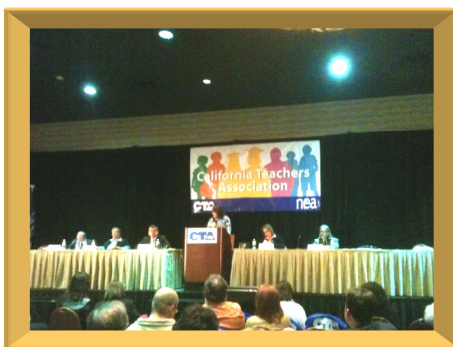
CTA holds its first Candidate Forum at State Council. This hosted Q & A forum featured candidates for Vice President and Secretary-Treasurer.