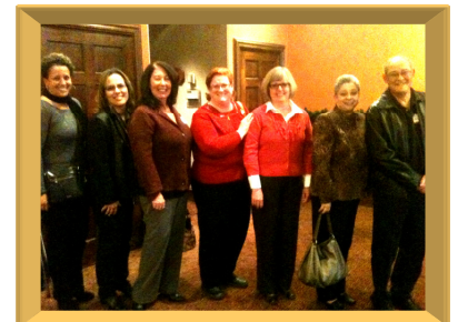
Barstow EA at the HDSCC School Board Luncheon in Bishop, CA.